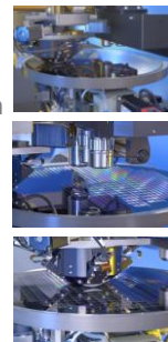
Onyx Wafer Inspection System