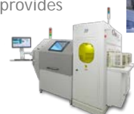
Onyx Wafer Inspection System