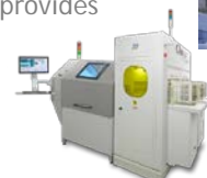
Onyx Wafer Inspection System